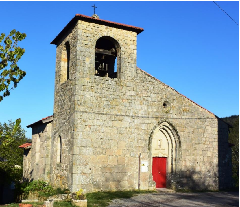
The Church of Saint-Basile in the Ardèche